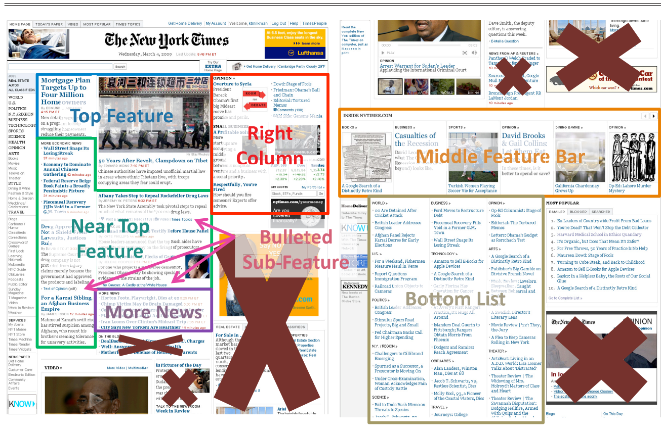
Figure 1 HOME PAGE LOCATION CLASSIFICATIONS

Notes: Portions with "X" through them always featured Associated Press and Reuters news stories, videos, blogs, or advertisements rather than articles by New York Times reporters.